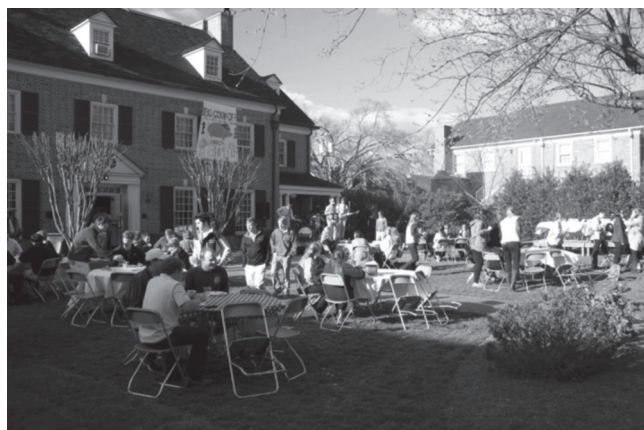
Guests enjoy the day at the Annual Barbeque Cook-Off

In other news, we recently held our annual Barbecue Cook-off to raise money for the Chapel Hill Fire Department. The event is a competition between participating IFC fraternities to see who can produce the best chopped or pulled pork BBQ. While we have held the event in the past, this year we strove to drastically increase the scale of the event by partnering with Delta Delta Delta sorority and signing on a record number of competing fraternities. Ultimately we had 11 fraternities compete in the event and estimate attendance in excess of 350 individuals. Net proceeds from the event