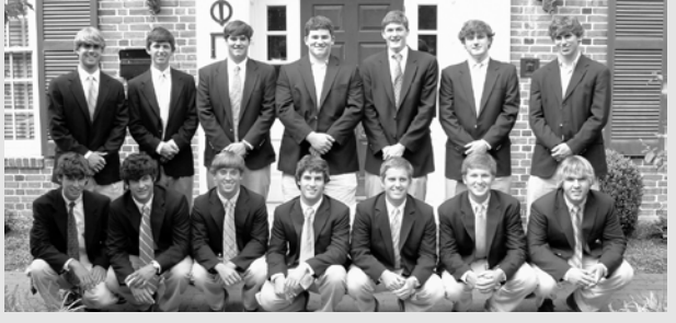
Welcome, fall 2004 pledges!

The undergraduates would like to thank the graduate brothers who submitted rush recommendations, and encourage similar input in future semesters to make sure that only the best men are considered for membership.